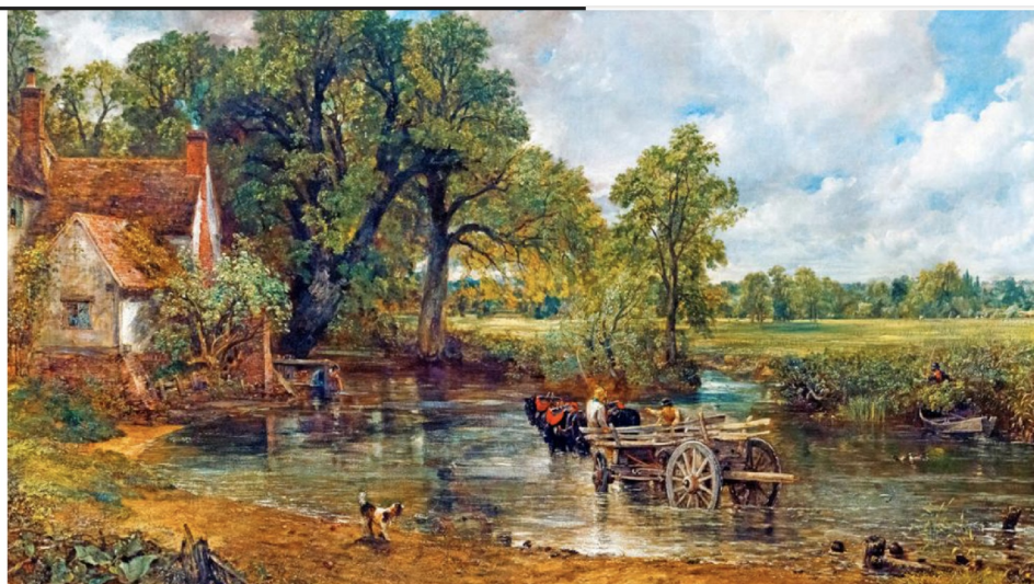
How Constable's The Hay Wain became one of the most famous paintings in the world