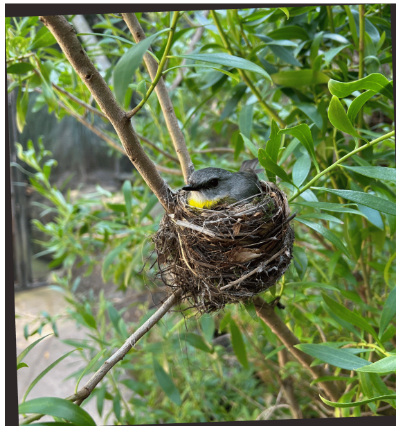
Keeping an eye on you